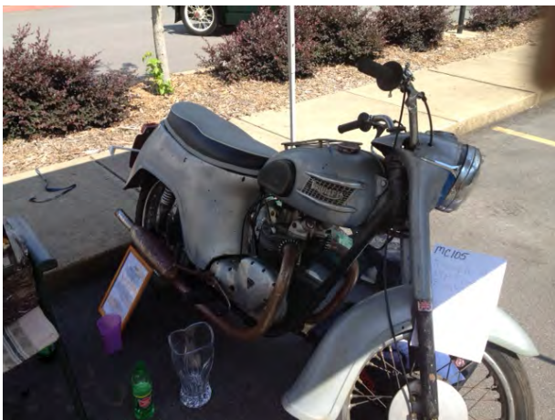
Note the crystal vase award is sitting in front of the real winner!!!